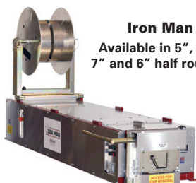
Iron Man Available in 5", 6", 7" and 6" half round.