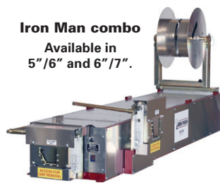
Iron Man combo Available in 5"/6" and 6"/7".

Ask about gutter machine and brake financing.